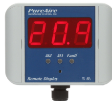
Remote Digital Display