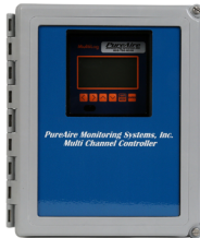
8 Channel Programmable Controller for O2 or Gas Monitors