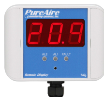
Remote Digital Display