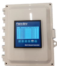
8 Channel Programmable Controller for O 2 or Gas Monitors ITEM #: 99196