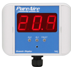
Remote Digital Display ITEM #: 99091