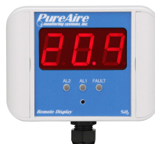
Remote Digital Display ITEM #: 99091