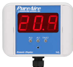
Remote Digital Display ITEM #: 99091