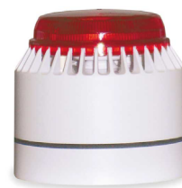
Red Horn/Strobe 24VDC ITEM #: 42002