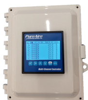
8 Channel Programmable Controller for O2 or Gas Monitors ITEM #: 99196