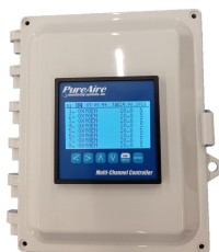
8 Channel Programmable Controller for O2 or Gas Monitors