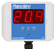
Remote Digital Display