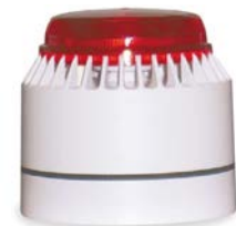
Red Horn/Strobe 24VDC ITEM #: 42002