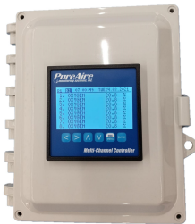
8 Channel Programmable Controller for O2 or Gas Monitors ITEM #: 99196