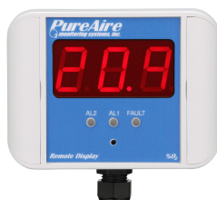
Remote Digital Display