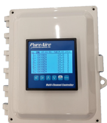
8 Channel Programmable Controller for O2 or Gas Monitors