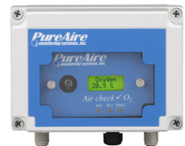
Sample Draw Oxygen Deficiency Monitor ITEM #: 99029