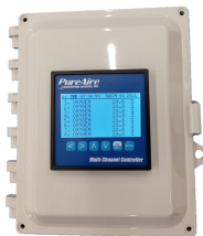
8 Channel Programmable Controller for O 2 or Gas Monitors ITEM #: 99196