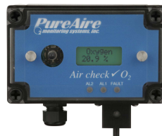
Oxygen Deficiency Monitor ITEM #: 99016