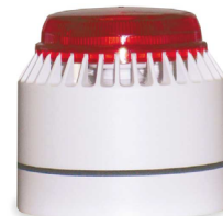
Red Horn/Strobe 24VDC ITEM #: 42002