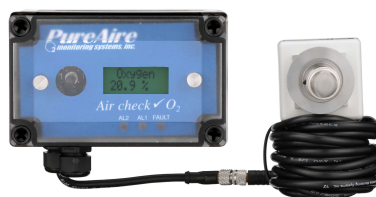
KF25 Oxygen Deficiency Monitor ITEM #: 99035