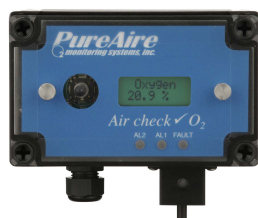
Oxygen Deficiency Monitor ITEM #: 99016