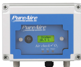
Sample Draw Oxygen Deficiency Monitor ITEM #: 99029