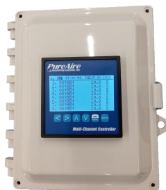
8 Channel Programmable Controller for O2 or Gas Monitors