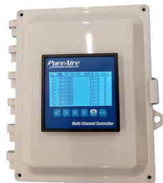
8 Channel Programmable Controller for O2 or Gas Monitors